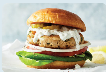
Classic Fish Burger