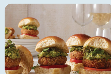
Breaded Crab Cakes