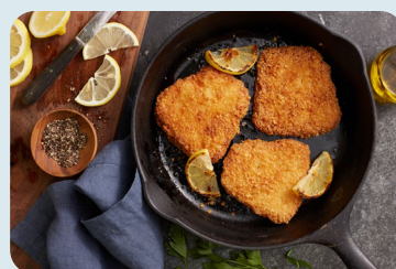
Breaded Fish Fillet